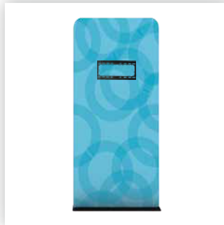
Reattach Monitor Bracket To Front Of Graphics And Tighten