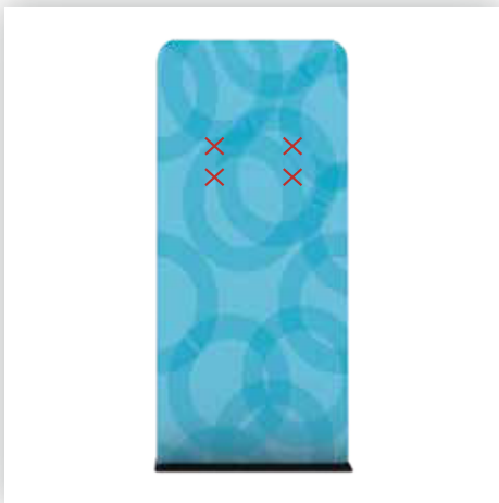
Make Slits With A Sharp Knife Where The Bolts Should Penetrate Graphic