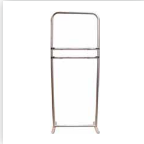
Once Marked With Marker, Remove Monitor Bracket