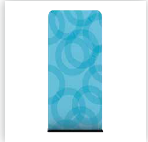
Put Graphic On The Frame