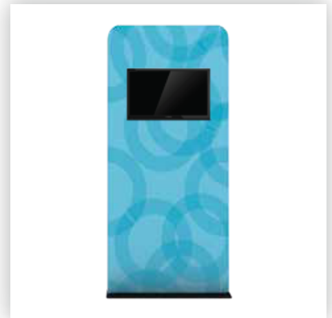
Attach Mounting Rails Onto Back Of Monitor