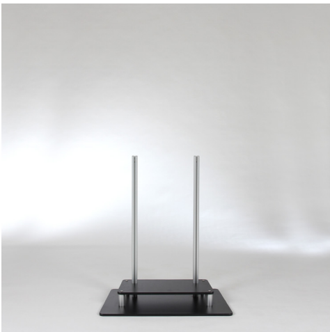
4) Once everything is tightened, place base upright.