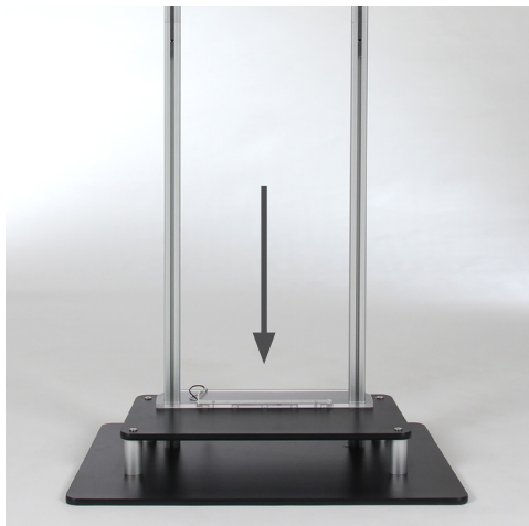
6) Slide optional light bar over square poles and allow to rest while monitor mount is attached.