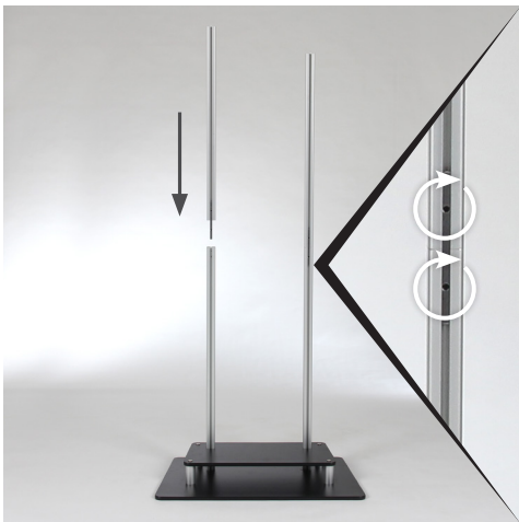
5) Attach square pole extensions using pole connectors. Tighten set screws with Allen wrench.