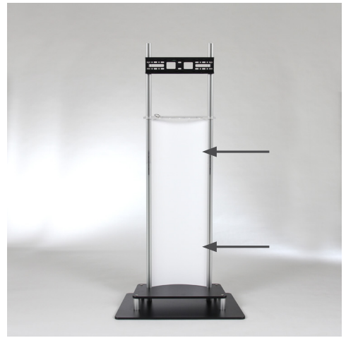
9) Insert panel into pole channels by applying tension, below optional light bar.