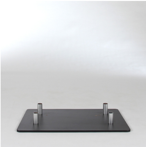
1) Attach 3" round poles to base with bolts from below.