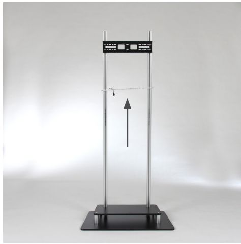
8) Slide optional light bar up. (Light Bar will rest on panel).