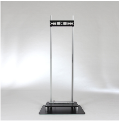
7) Attach monitor mount using additional Allen wrench.