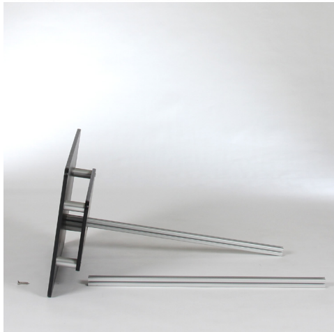
3) Now slide 36" poles through square holes & attach to base with bolts from below.