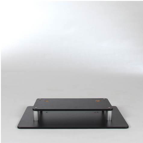
2) Next, secure upper base shelf to round poles with bolts.