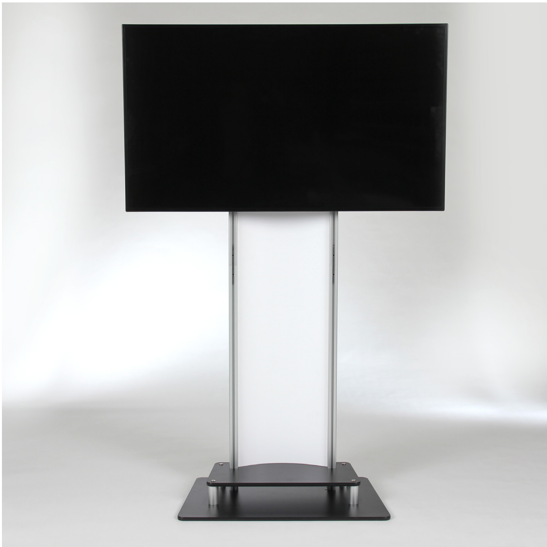
10) Finish by attaching monitor mount brackets to the back of the monitor (see monitor mount instructions) & install monitor onto the stand. Plug in optional light bar if applicable.