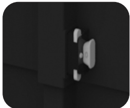
Close up of latch