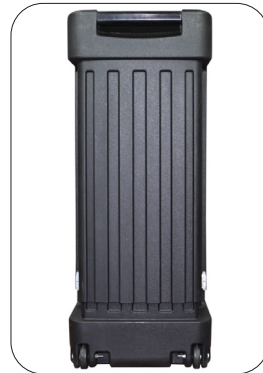
Handle and wheels