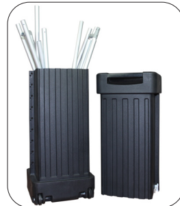
Case fits with Formulate tubes and graphics