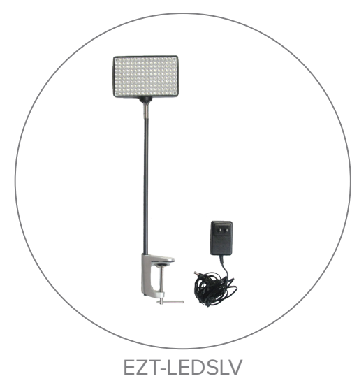
(qty 4) Recommended for 20ft Display (qty 4) Recommended for 20ft Display