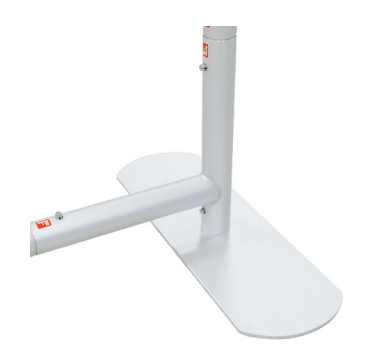
Tool Free Foot Connection Outer Foot Dims: 19.75" L x 6.25" W x 6mm H Center Foot Dims: 17.6" L W x 11.9" W x 6mm H