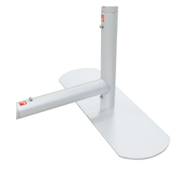
Tool Free Foot Connection Outer Foot Dims: 19.75" L x 6.25" W x 6mm H Center Foot Dims: 17.6" L W x 11.9" W x 6mm H