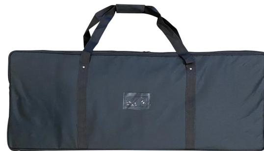
Includes travel bag with wheels: Dimension: 41.7"W x 15.7"H x 4.7" D