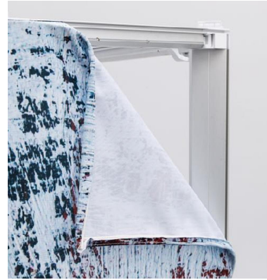
Silicone Edge Graphics (SEG)