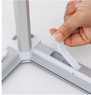
QSEG Latch System