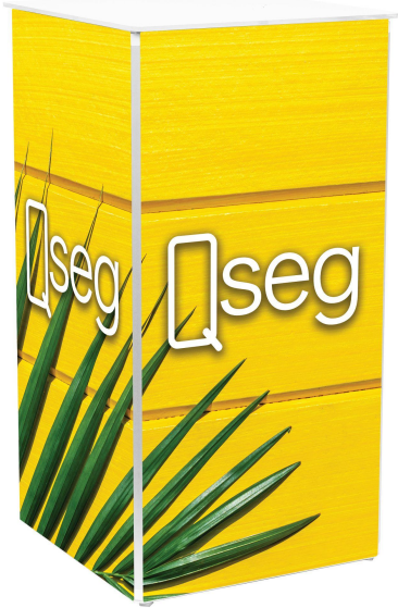
QSEG Counter Small