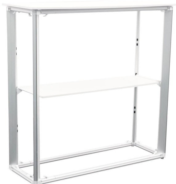
QSEG Counter Large Hardware Only w/Inner Shelf Installed