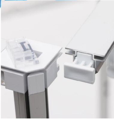
Tool Free Assembly