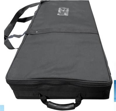
Top Pull Handle