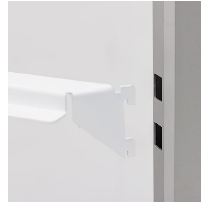
3 Mounting Locations for Inner Shelf