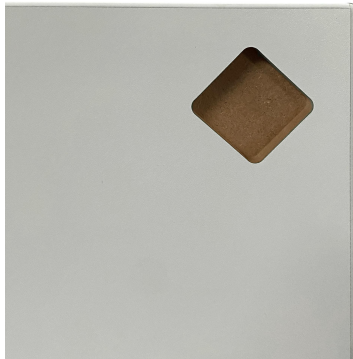
Notches in corners on bottom of countertop keep it in place