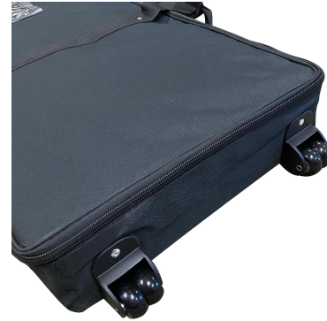
Travel Bag w/Wheels