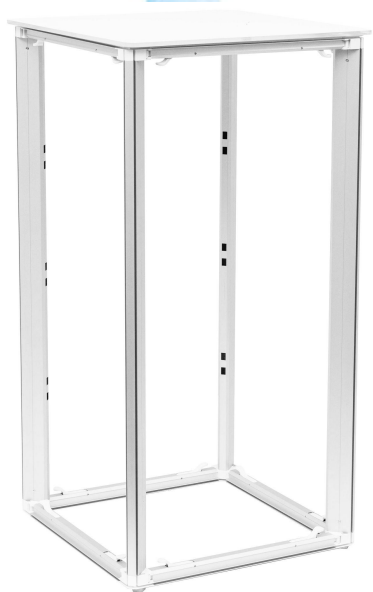
QSEG Counter Small Hardware Only