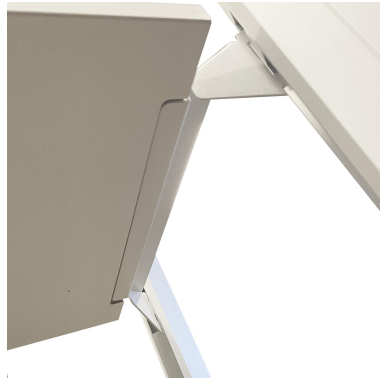
Notches in corners on bottom of countertop keep it in place